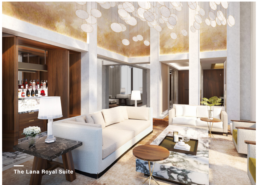
The Lana Royal Suite