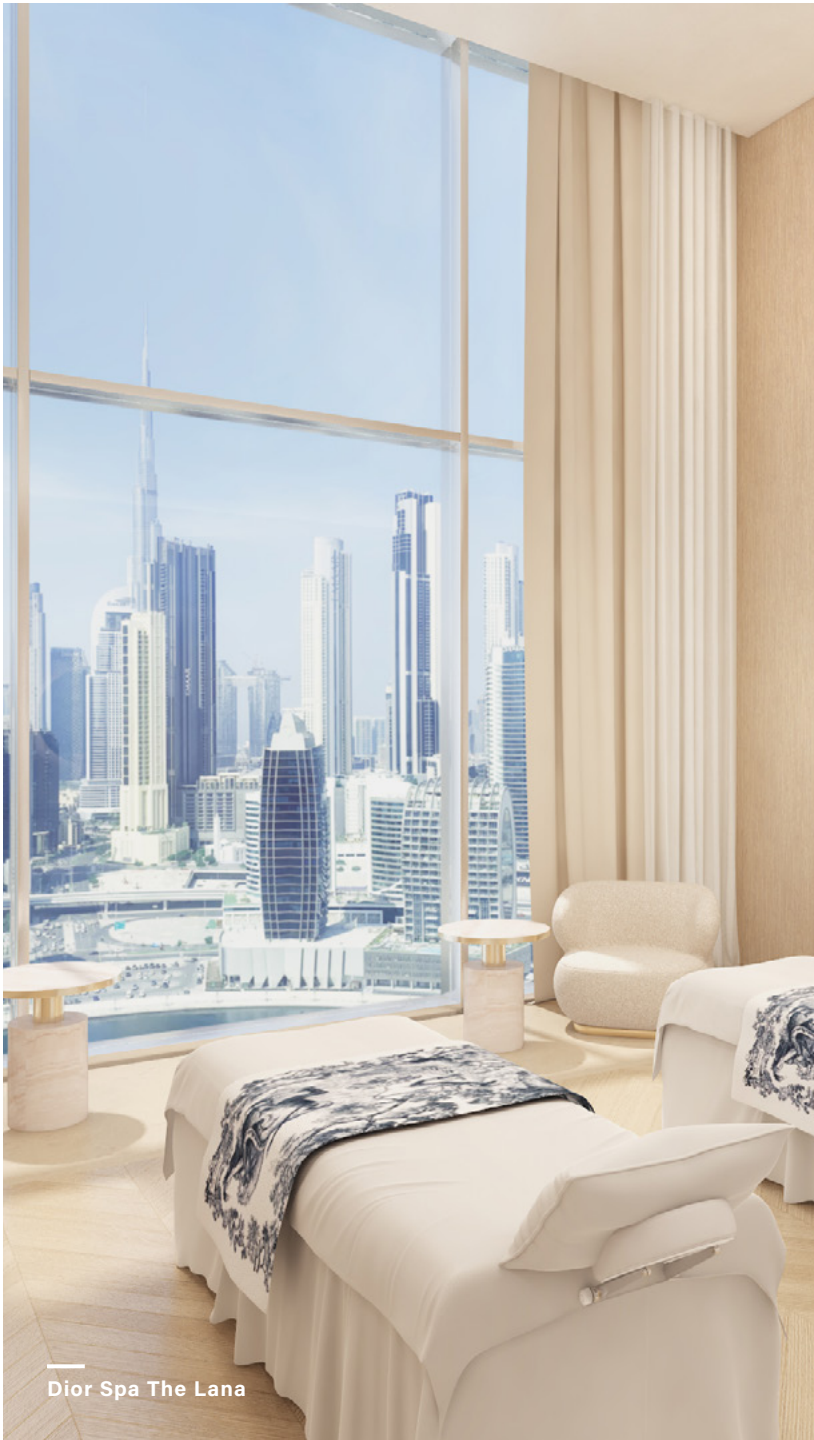
Dior Spa The Lana