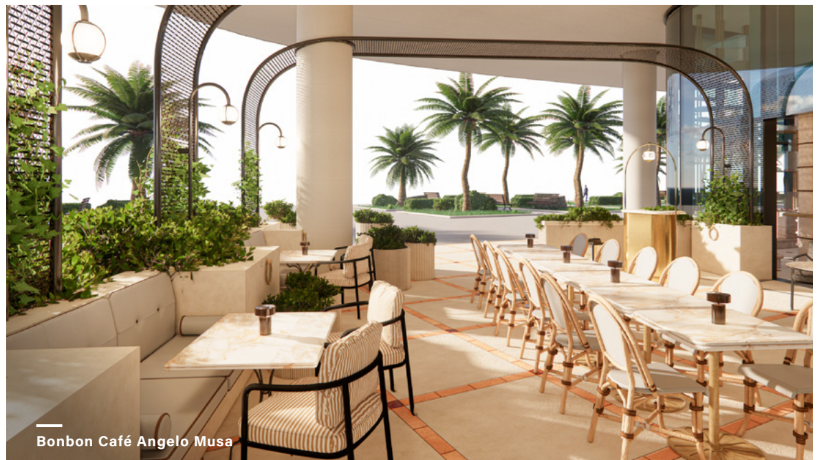
Bonbon Café Angelo Musa

Located on the 29th floor, our beautiful spa combines Dior's prestigious treatments with timeless, calming design for the ultimate wellbeing experience. Its privileged views gaze out over Downtown Dubai and Burj Khalifa.