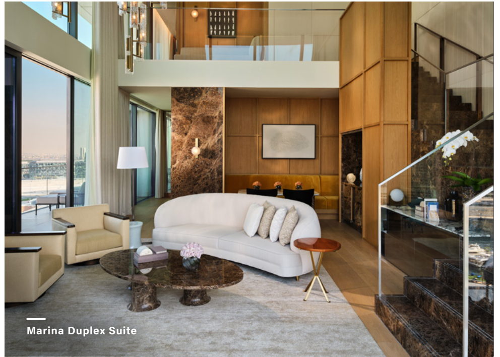
Marina Duplex Suite