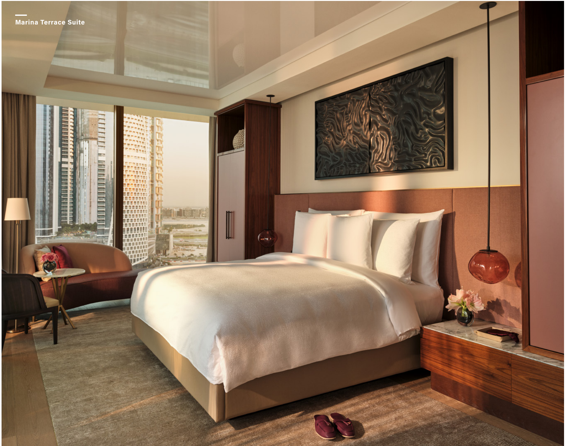
— Marina Terrace Suite