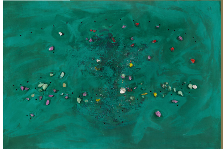
LUCIO FONTANA, CONCETTO SPAZIALE, 1956 Casa Museo Boschi Di Stefano, Milano

Enjoy a private tour created exclusively for guests of Milan's Hotel Principe di Savoia. Your passionate, knowledgeable guide has over 10 years of experience in the art world and can adapt the content to you. All levels of interest can follow in the footsteps of this legendary artist, from the mildly curious to Fontana enthusiasts.