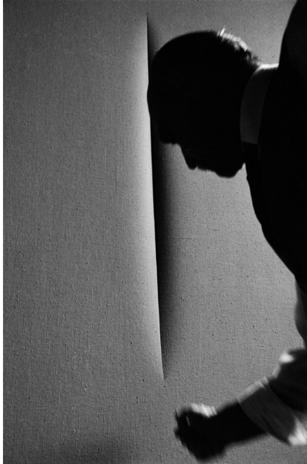
LUCIO FONTANA, L'ATTESA, 1964