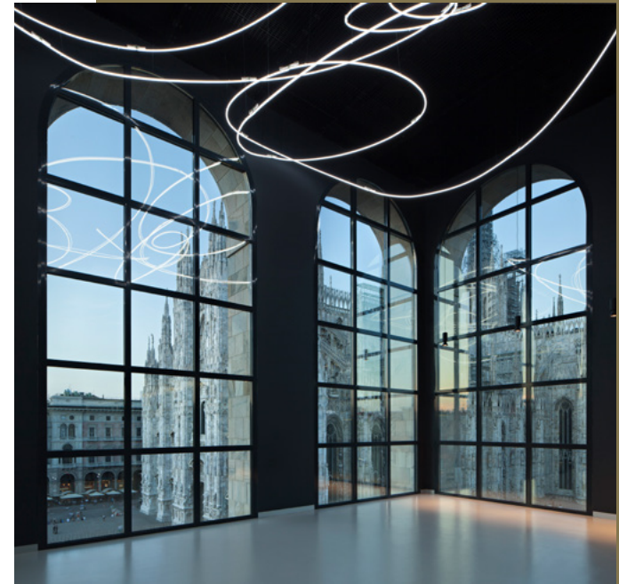
LUCIO FONTANA, NEON STRUCTURE MADE FOR THE 9 TH MILAN TRIENNIAL, 1951

The courtyard of his legendary studio provides the backdrop for his creative process, leading us to the Duomo, where its lace-like Gothic design complements Fontana's glorious 'Neon structure', suspended on the top floor of the adjacent Museo del Novecento. Made from 100m/328ft of neon tube, Fontana's prominence in the city is nowhere more apparent.