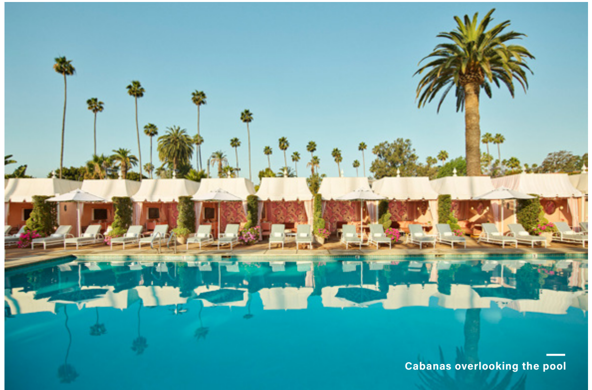
Cabanas overlooking the pool

The two spectacular Presidential 'ultra' Bungalows are the most prestigious presidential suites in Los Angeles. Each three-bedroom bungalow blends the indoor and outdoor experience effortlessly through 464m 2 /5,000ft 2 of living space. They feature a spacious great room with 4m/12ft cottage-style ceiling, chef's kitchen, expansive outdoor living area, outdoor fireplace and shower, and a wall of floor-to-ceiling glass doors overlooking a private infinity plunge pool.