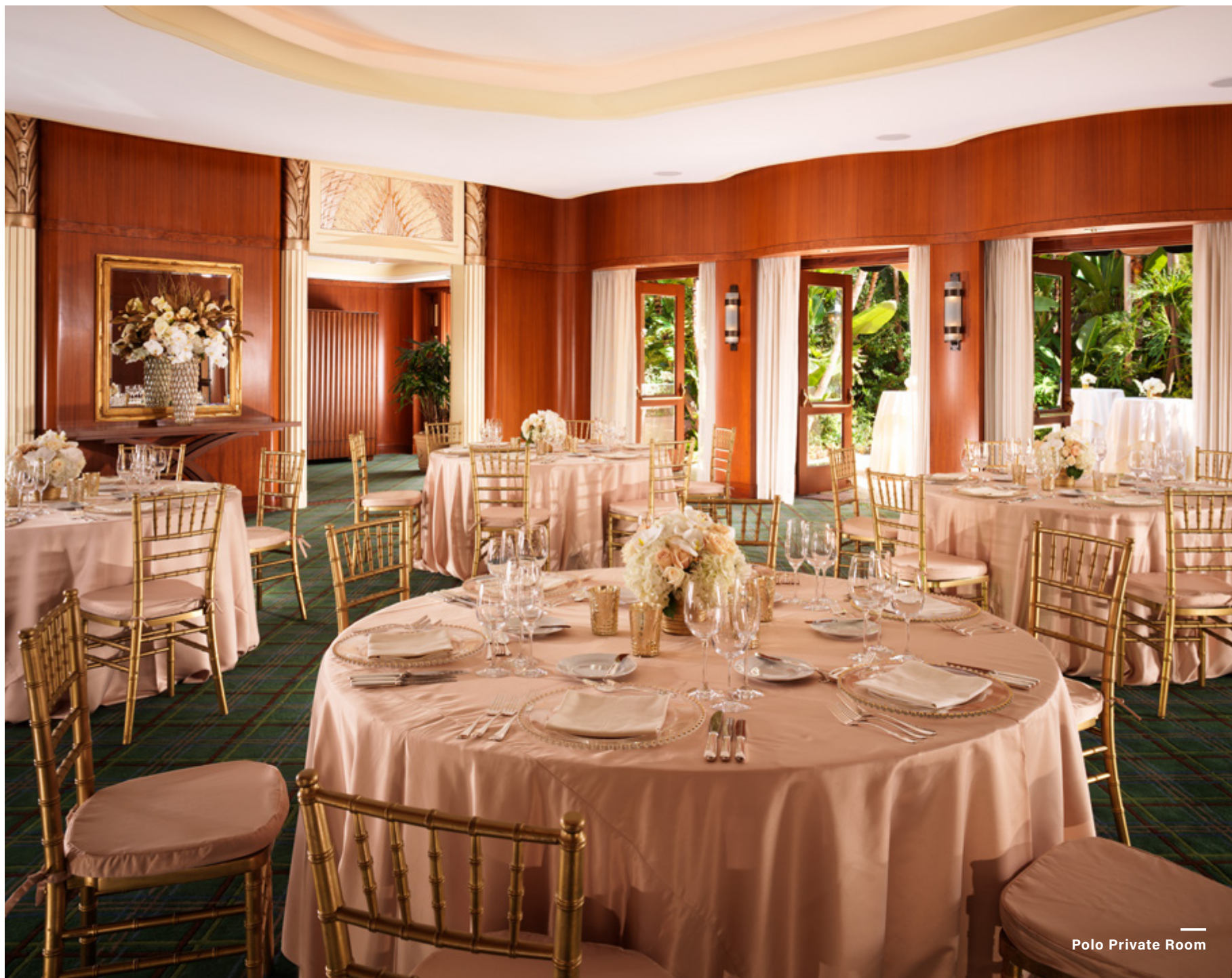
Polo Private Room