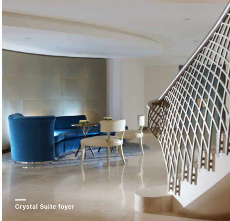
Crystal Suite foyer