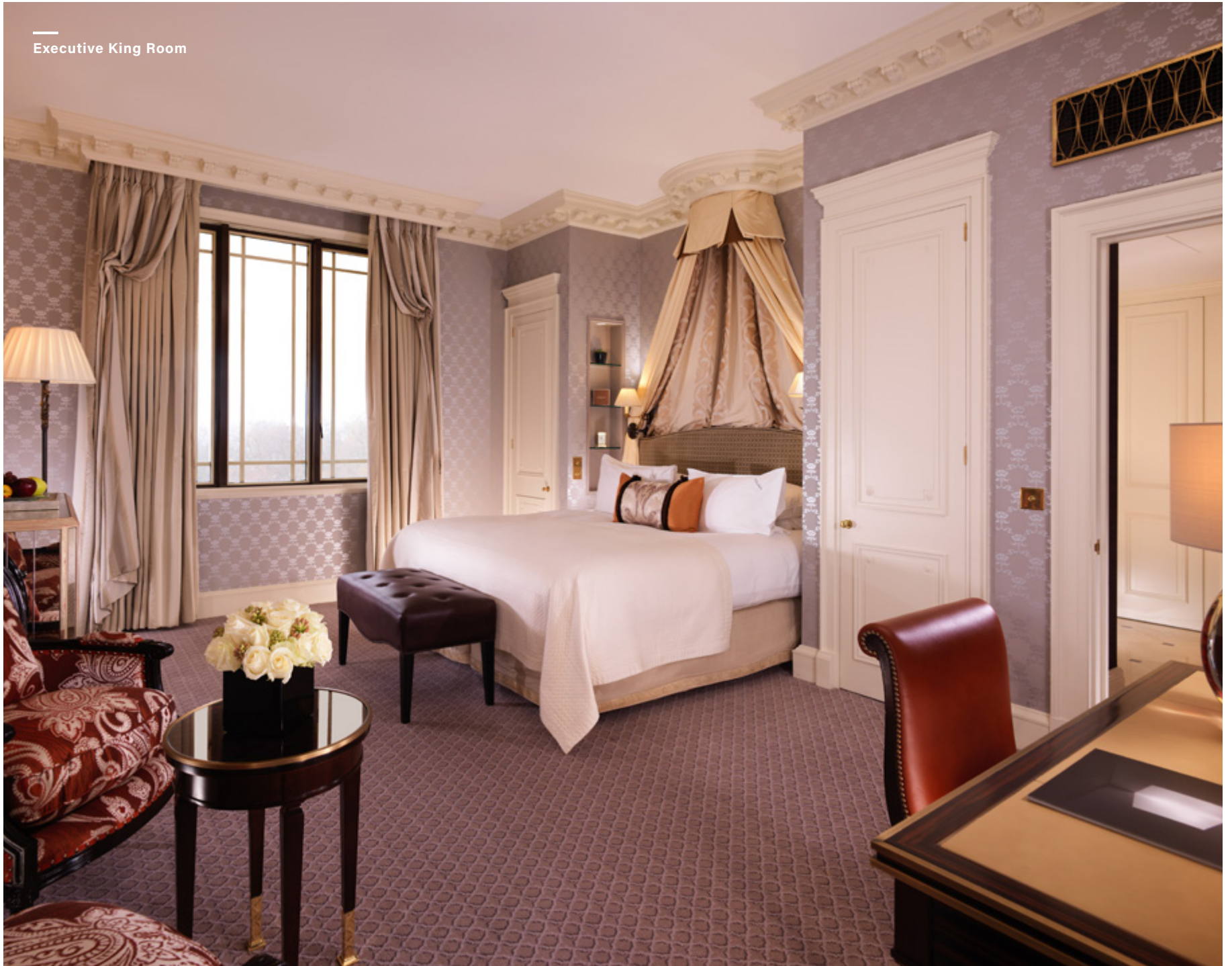
Executive King Room