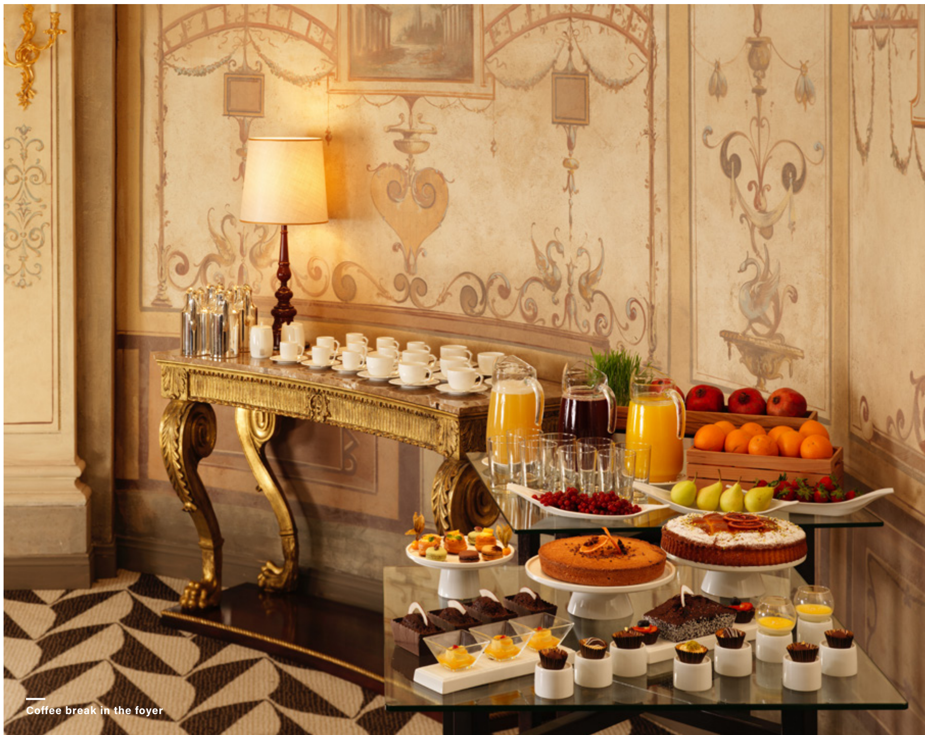
Coffee break in the foyer