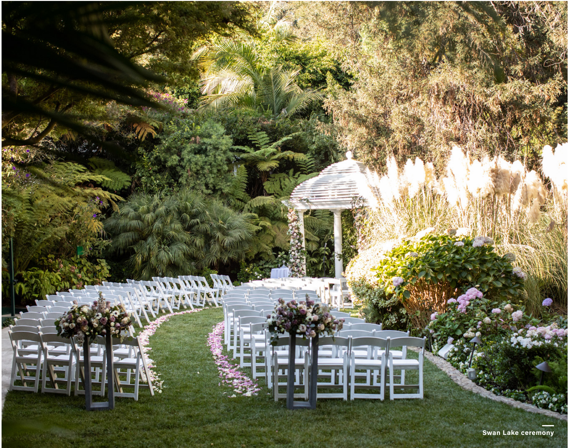
— Swan Lake ceremony