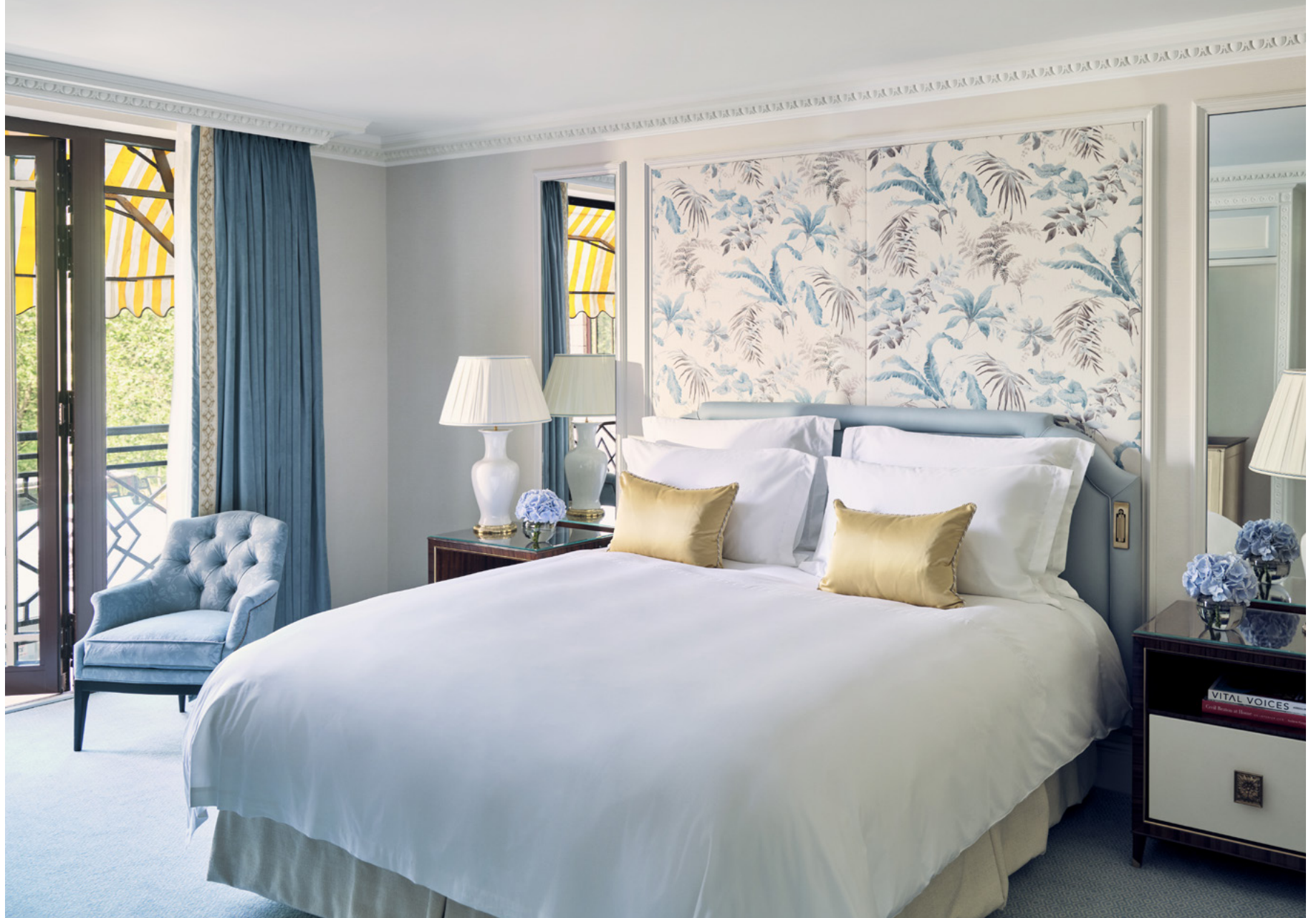
Executive Park View Room