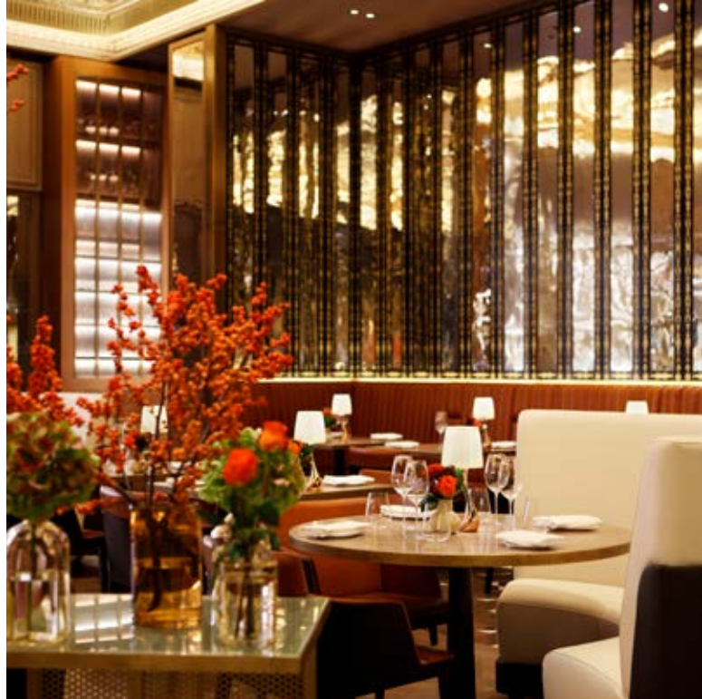
The Grill at The Dorchester